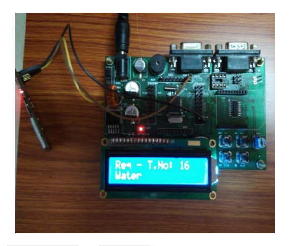
Fig: Order received for water