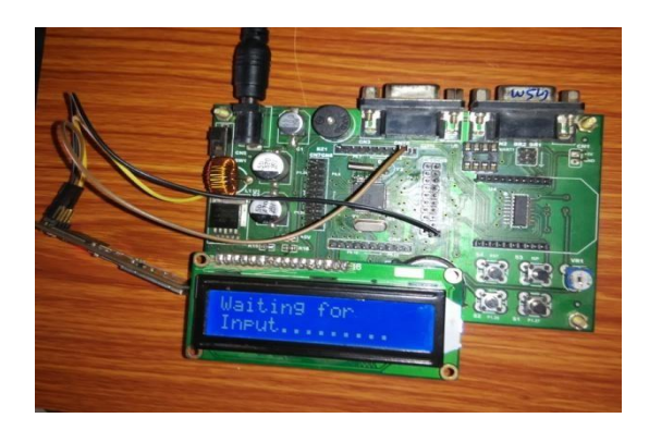
Fig: Status when no input (order)is given