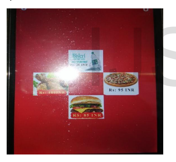
Fig: Menu options at customer mobile

Following are the screenshots of actual results of our system.